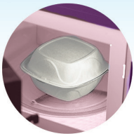
Can be used in the microwave