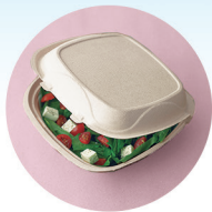
Resistant to grease

100% compostable, Darnel Naturals is a pulp based product that is ideal for restaurant and take out use. Manufactured to be grease resistant, and can withstand temperatures of up to 350°F, this line of hinged lid containers is also 100% recyclable.